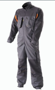
COMBINATION OF WORK