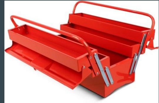
CHEST AT TOOLS