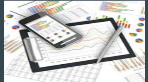
DRAFTING TECHNICAL DOCUMENTATION