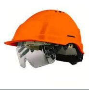
SAFETY HELMET AND GLASSES