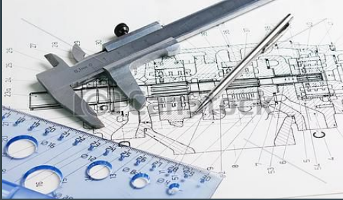
DRAWING OF EQUIPMENT